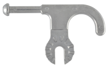
Disconnect hook (HOK-HS166)