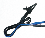
AL-33B Special Resistance Test Lead